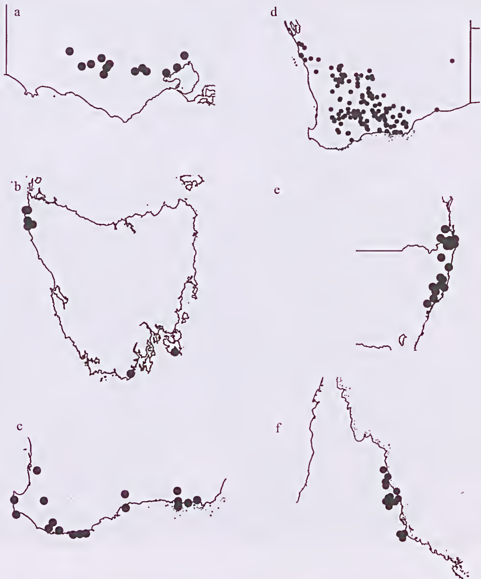
Figure 2. Distribution of a. Thelymitra gregaria ; b. T. aggericola ; c. T. granitara ; d. T. petraphila ; e. T. fragrans ; f. T. queenslandica

their length, the individual hairs 0.6–1 mm long. Anther inserted about mid-way along column, ovoid, 2.5–3.5 mm long, 1.5–2 mm wide, connective produced into a beak 0.3–0.8 mm long; pollinarium 1.8–2.5 mm long; viscidium more or less circular, 0.5–0.7 mm diam., often thrust forward; pollinia white with coherent pollen. Stigma situated at base of column, ovate-quadrate, 1.5–2.5 mm long, 1.2–2.2 mm wide, margins irregular. Capsules obovoid, 8–15 mm long, 4–7 mm wide, erect, ribbed. (Fig. 1d)